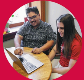
School of Education Academic Advisors